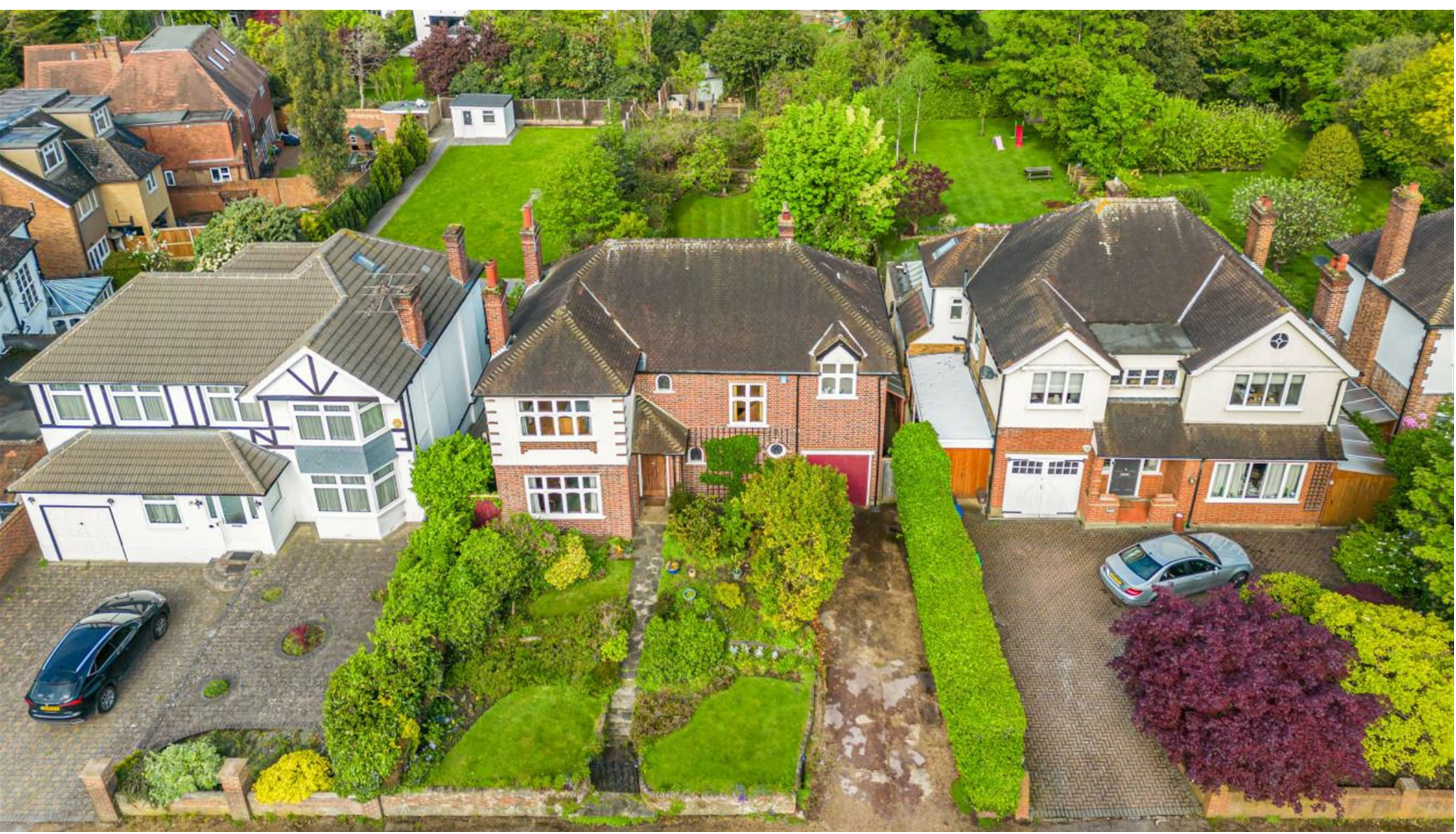
Orchard Rise Kingston upon Thames KT2 7EY